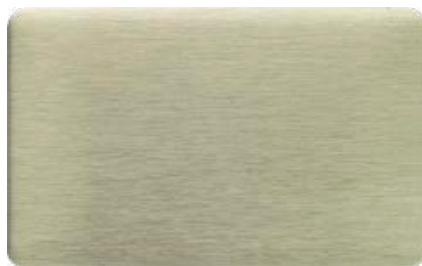
Aluform Superior Dubai