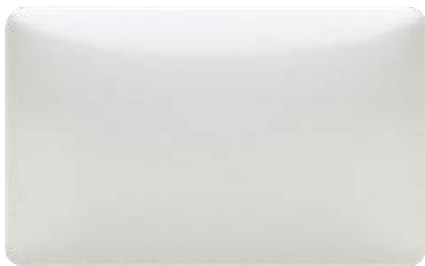
Aluform Superior Washington