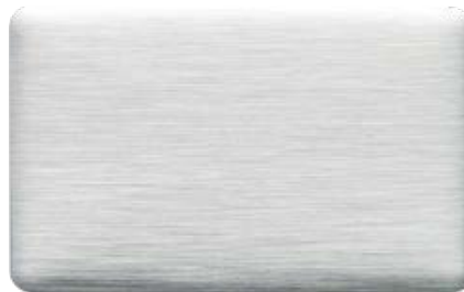
Aluform Superior Chicago