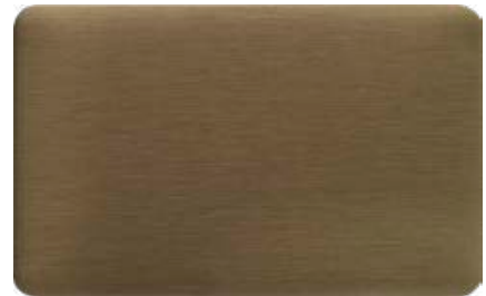
Aluform Superior Moscow