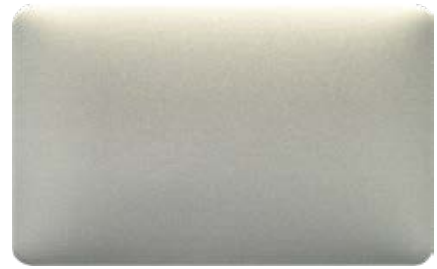
Aluform Superior San Francisco