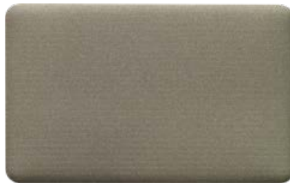
Aluform Superior Beijing