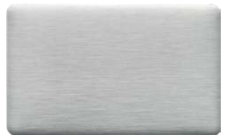
Aluform Superior Toronto