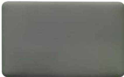
Aluform Superior Paris