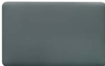
Aluform Superior Tokyo