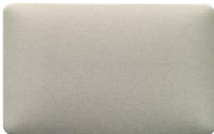
Aluform Superior Barcelona