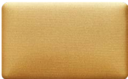
Aluform Superior Los Angeles