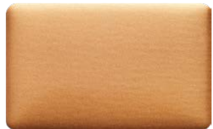
Aluform Superior Prague