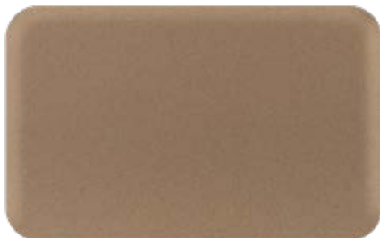
Aluform Superior Abu Dhabi