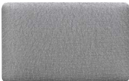
Aluform Superior New York