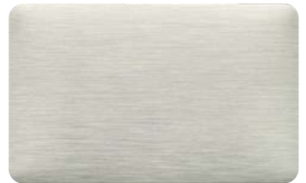
Aluform Superior Hong Kong