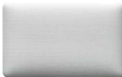
Aluform Superior Miami