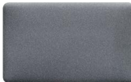
Aluform Superior Singapore